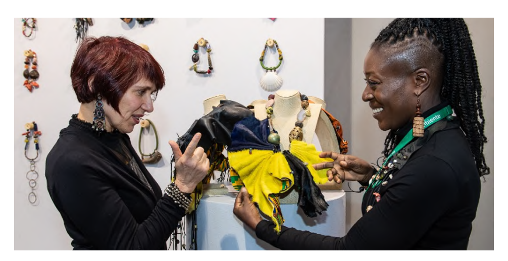
Diversity in action: German and international talents at Ambiente 2019.

Fresh smart design ideas need to be in a place where they're visible. Ambiente's promotional programme Talents gives interior design talents the opportunity to show their work to decision-makers and talent scouts from across the international consumer goods and design world. Ambiente will be held from 7 to 11 February 2020. Until 22 October 2019, young designers can use their surprising, daring and sometimes unconventional ideas to apply for free exhibition space at Ambiente.