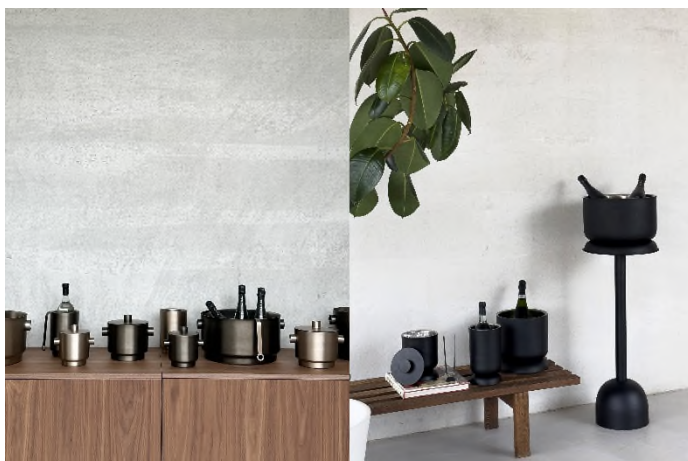
XLBoom primarily presents high-quality bar sets and accessories, wine and champagne coolers for the hospitality and HoReCa sector.