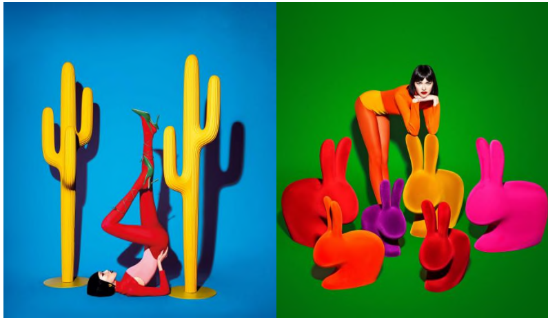
Designed by Stefano Giovannoni for Qeeboo Milano: The column-shaped Saguaro plant transforms into a 195 cm high clothes rack and the colourful Qeeboo Rabbitt chair brings more joy and lightness to public spaces.

Qeeboo Milano S.r.l. (Hall 3.1 D36) stands out with particularly eye-catching interior design home accessories and lighting. With a touch of pop, the creations are intended to emphasise the style of each individual, bring originality to the surroundings and provide surprises, according to the manufacturer. Designer Stefano Giovannoni, for example, has created a coat stand that is reminiscent of the columnar saguaro plant from the Sonoran Desert. Available in various colours, it is made from recyclable polyethylene and has a powder-coated metal base. The colourful Qeeboo Rabbitt chair also attracts attention in public spaces, both indoors and outdoors.