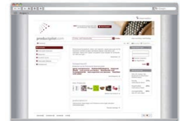
business to business portal: productpilot.com