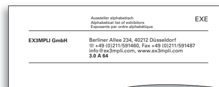
»Alphabetical List of Exhibitors«, Obligatory Media Package