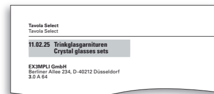
»List of Exhibitors by Product Groups«, Package 1 by the example of Ambiente