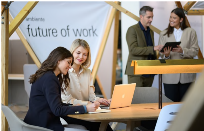
The focus of the innovations from exhibitors and of the Future of Work area in the Ambiente Working section is on people and all their needs.

Frankfurt am Main, March 2024. Working between feel-good zone, focus room and meeting point. The transformation of the working world is becoming clear and multifaceted - as this year's Ambiente has shown in its growing Working segment. Innovative room concepts, clever tools and office furnishings that were the exception rather than the rule just a few years ago are becoming the new standard. Both spheres benefit from the innovative ideas and developments of suppliers: Corporate offices and home offices.